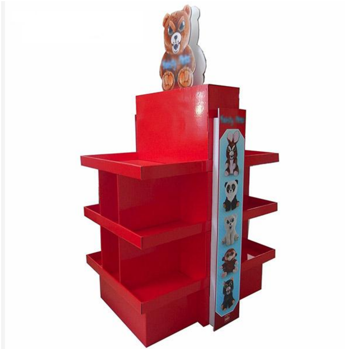
Sinst Strong Double Sides Exhibiting Corrugated Display Dump Bin for Fruit Process